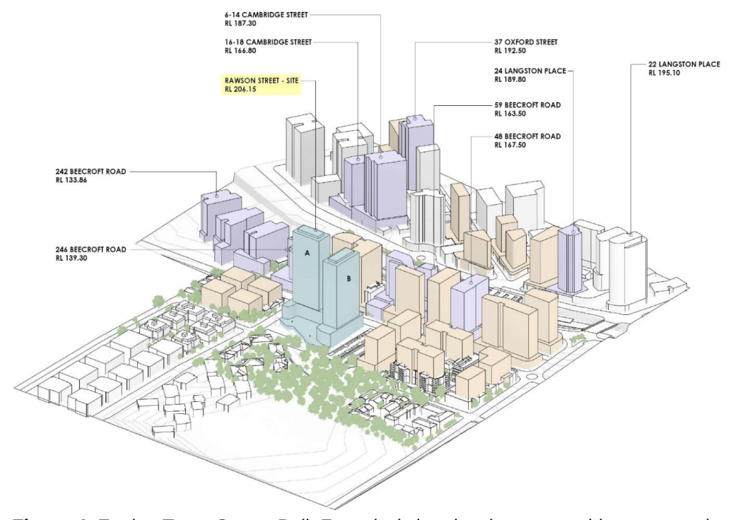
Figure 4 : Epping Town Centre Built Form (existing development - white, approved development - purple, development possible under existing controls – orange, proposed subject site development – blue)

32. It is noted that Council officers have amended the applicant's proposed Height of Buildings map as part of the Planning Proposal (refer to Attachment 1 ) to better align the height mapping with the applicant's two tower scheme ( Attachment 3 ). The applicant has since agreed with Council officer's recommended height mapping.