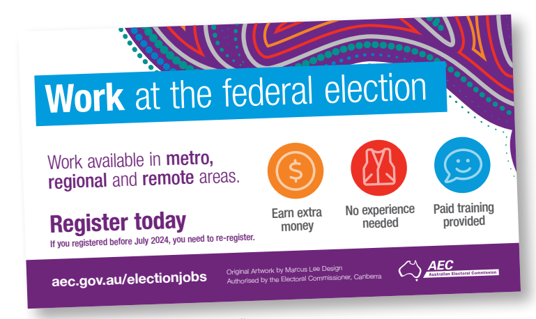
First Nations peoples Facebook tile