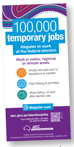
First Nations peoples DL flyer